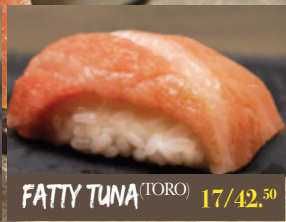
FATTY TUNA (TORO) 17/42.50