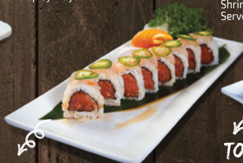
BAJA CALIFORNIA ROLL 15.95

Cucumber, Avocado, Salmon Inside & Salmon, Sliced Lemon on Top