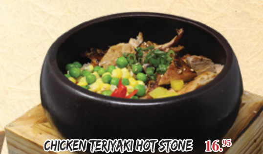
CHICKEN TERIYAKI HOT STONE 16. 95

Sliced Salmon, Red Ginger, Masago, Green Onion, Fukujinzuke, Pickled Radish, Seaweed with Rice on Hot Stone