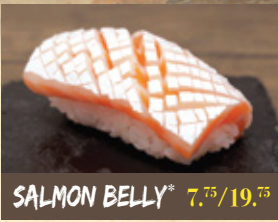
SALMON BELLY* 7.75/19.75