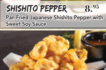
CALAMARI 10. 95 Lightly Fried Calamari Served with House Made Sauce