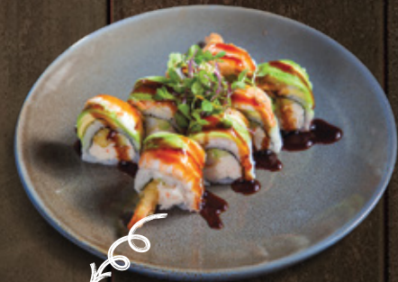
IN & OUT SHRIMP ROLL 15.95

Crabmeat, Shrimp Tempura, Avocado, Cucumber Inside. Spicy Tuna and Crunch Powder on Top. Served with Eel Sauce and Spicy Mayo