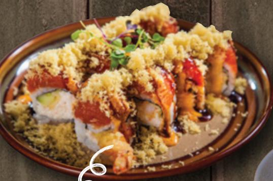
SUPER DRAGON ROLL 16.25

Crabmeat, Cucumber, Avocado, Shrimp Tempura Inside Fresh Water Eel, Avocado, Crunch Powder on Top Served with Eel Sauce