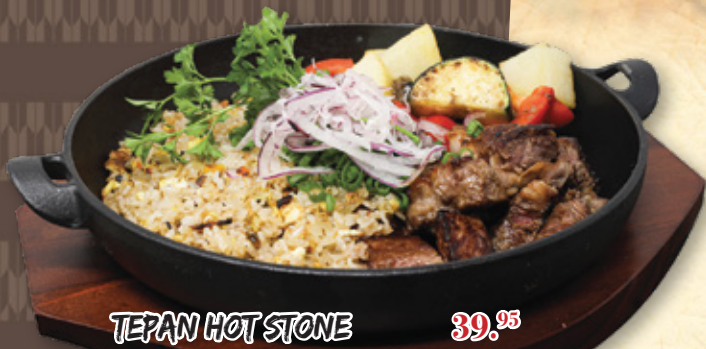
TEPAN HOT STONE 39. 95

"GRAB LUNCH FOR $2 OFF!!" (11:30AM~4:30PM)