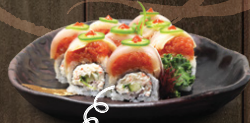
MEXICAN ROLL 15.95

Salmon on Top of California Roll with Shrimp Tempura. Whole Roll Baked with Bake Spicy Mayo Sauce. Served with Eel Sauce and Green Onion