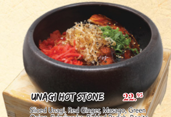
UNAGI HOT STONE 22. 95

Panko Fried Pork/Chicken Croquette, Ajitempura Served with Rice and Curry on Hot Stone