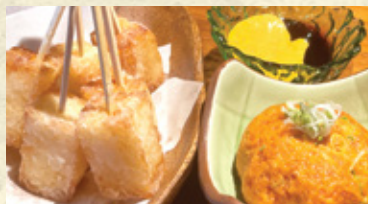
CRISPY RICE W/SPICY TUNA* 10. 95 6pcs/ Spicy Tuna, Avocado, Jalapeno, Spicy Mayo, Eel Sauce on Top of Buttered Crispy Rice