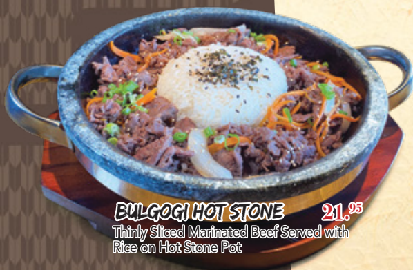
BULGOGI HOT STONE 21. 95

Sliced Grilled Chicken, Red Ginger, Green Onion, Fukujinzuke, Pickled Radish, Teriyaki Sauce with Rice on Hot Stone