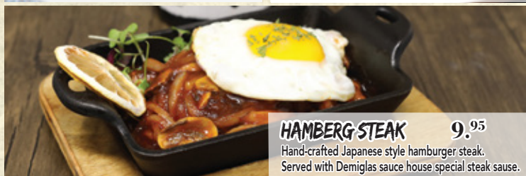
HAMBERG STEAK 9. 95 Hand-crafted Japanese style hamburger steak. Served with Demiglas sauce house special steak sause.