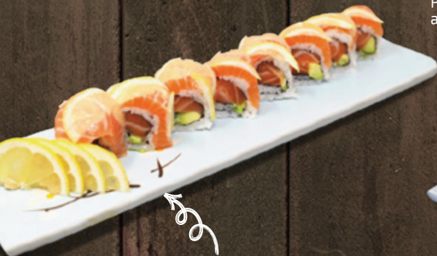
LEMON SALMON ROLL 16.95

Crabmeat, Cucumber, Shrimp Tempura Inside, Shrimp and Avocado on Top. Served with Eel Sauce