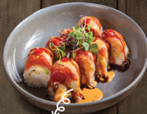
HOT NIGHT ROLL 15.50

Shrimp Tempura, Crabmeat, Cream Cheese Inside Cooked Shrimp, Avocado, Crunch Powder on Top. Served with Eel Sauce