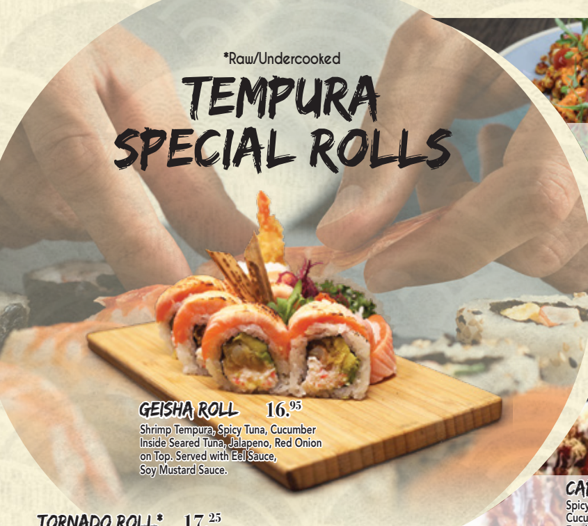
GEISHA ROLL 16. 95 Shrimp Tempura, Spicy Tuna, Cucumber Inside Seared Tuna, Jalapeno, Red Onion on Top. Served with Eel Sauce, Soy Mustard Sauce.