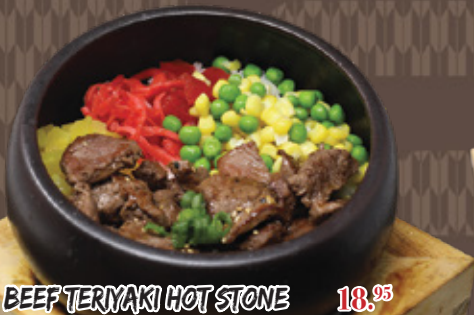
BEEF TERIYAKI HOT STONE 18. 95

Sliced Unagi, Red Ginger, Masago, Green Onion, Fukujinzuke, Pickled Radish, Bonito with Rice on Hot Stone