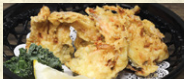
SOFT SHELL CRAB 11. 95 Deep Fried Soft Shell Crab With Ponzu