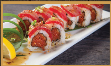
CAJUN TUNA ROLL 16.75

Spicy Tuna, Crabmeat, Avocado Wrapped in Soy Paper and Potato String, Whole Deep Fried. Served with Spicy Mayo, Eel Sauce, and Sriracha.