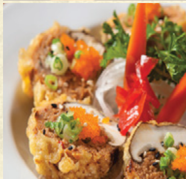
MONKEY BRAIN 9. 95 Deep Fried White Button Mushroom with Spicy Tuna and Crabmeat Served with Eel Sauce, Green Onion and Masago