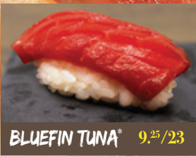
BLUEFIN TUNA* 9.25/23

SUSHI (2PCS) | SASHIMI (5 PCS) $1 CHARGE FOR SEARED SUSHI