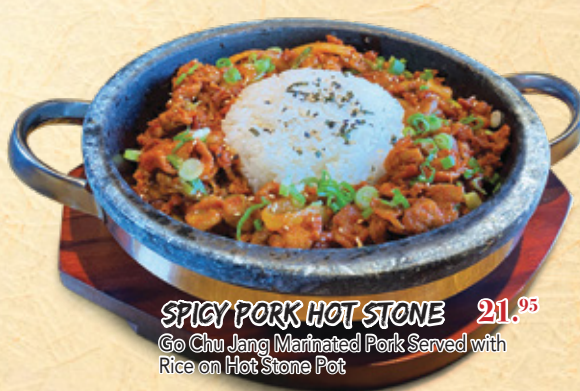
SPICY PORK HOT STONE 21. 95

Thinly Sliced Marinated Beef Served with Rice on Hot Stone Pot