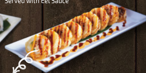
TORNADO ROLL 17.25

Spicy Tuna, Cucumber Inside Fresh Yellowtail, Jalapeno on Top Served with Ponzu Sauce