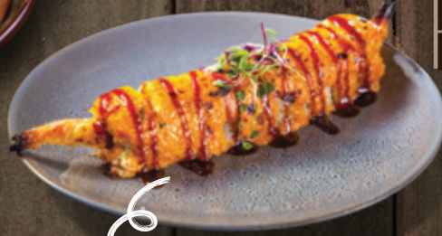
KING ROLL 16.25

Crabmeat, Cucumber, Avocado, Shrimp Tempura Inside Fresh Water Eel, Avocado, Crunch Powder on Top Served with Eel Sauce