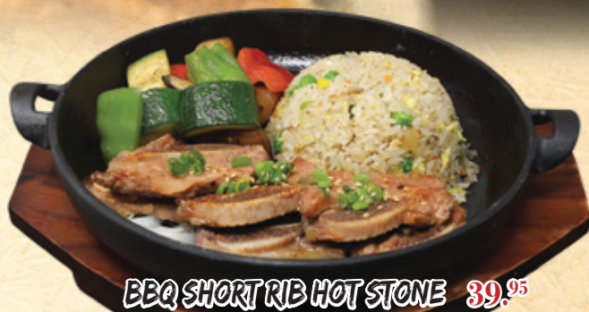
BBQ SHORT RIB HOT STONE 39. 95

Choice of Ribeye Steak or Fillet Mignon Grilled Shrimp, Fried Veggie, Fried Rice