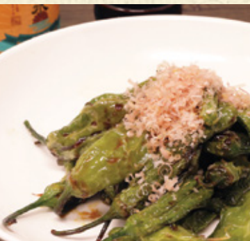
SHISHITO PEPPER 8. 95 Pan Fried Japanese Shishito Pepper with Sweet Soy Sauce