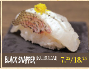
BLACK SNAPPER (KURODAI) 7.25/18.25