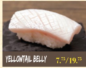
YELLOWTAIL BELLY 7.75/19.75