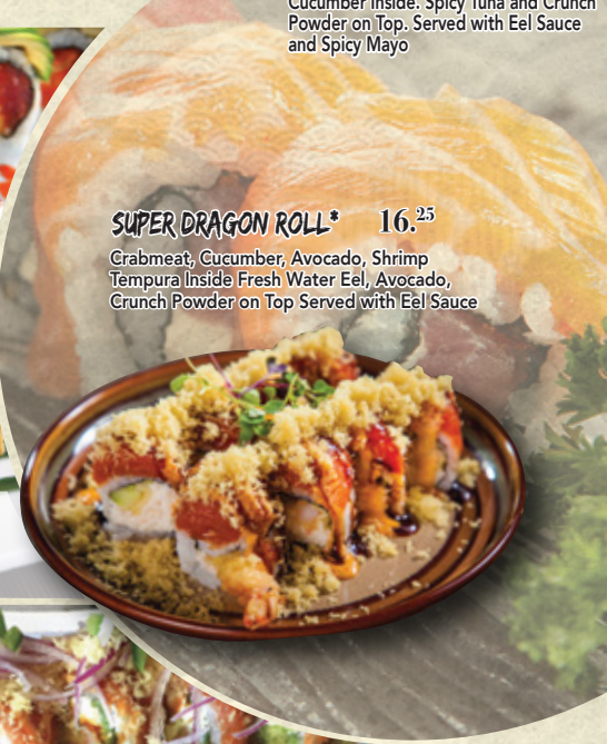
SUPER DRAGON ROLL* 16. 25 Crabmeat, Cucumber, Avocado, Shrimp Tempura Inside Fresh Water Eel, Avocado, Crunch Powder on Top Served with Eel Sauce