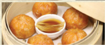
SPICY SEAFOOD DUMPLING 8. 95 Spicy pork and shrimp dumplings, with a heat of every bite