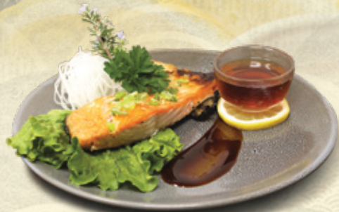
YELLOWTAIL COLLAR 15. 95 SALMON COLLAR 13. 95

Grilled Yellowtail/Salmon Collar, Served with Ponzu Dressing/daily Limited Quantity