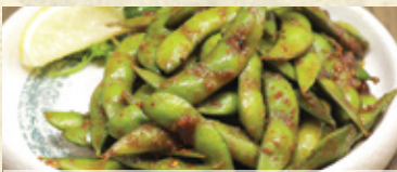
SALTED EDAMAME / GARLIC EDAMAME 5. 95 / 8. 95 Edamame with House Made Garlic Sweet Soy