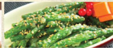
GARLIC GREEN BEAN 8. 95 Pan Sauteed Green Bean with House Garlic Sauce