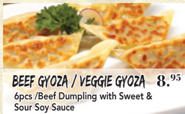
BEEF GYOZA / VEGGIE GYOZA 8. 95 6pcs /Beef Dumpling with Sweet & Sour Soy Sauce