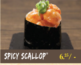
SPICY SCALLOP* 6.25/-