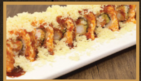
OMG ROLL 16.25

Shrimp Tempura, Cream Cheese, Avocado Inside. Deep Fried Whole Roll, Spicy Crabmeat on Top Served with Eel Sauce, Spicy Mayo, Wasabi Mayo.