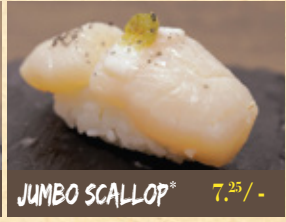
JUMBO SCALLOP* 7.25/-