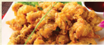
SESAME CHICKEN 9. 95 Deep Fried Chicken Served with House Made Spicy Sauce