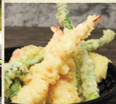
MIXED TEMPURA/ SHRIMP 9. 95 4pcs/ Assorted Shrimp & Vegetable Tempura