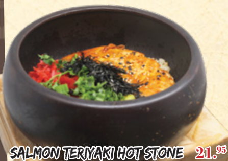
SALMON TERIYAKI HOT STONE 21. 95

Sliced Beef, Red Ginger, Green Onion, Fukujinzuke, Pickled Radish, Teriyaki Sauce with Rice on Hot Stone