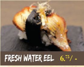
FRESH WATER EEL 6.75/-