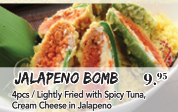
JALAPENO BOMB 9. 95 4pcs / Lightly Fried with Spicy Tuna, Cream Cheese in Jalapeno