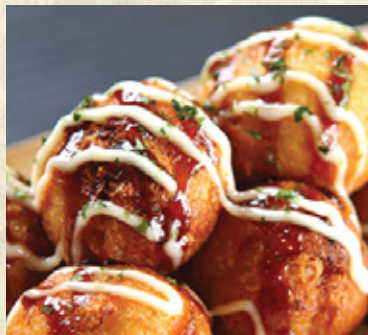
TAKOYAKI 9. 95 Fried Osaka Style Octopus Ball