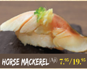
HORSE MACKEREL (Aji) 7.95/19.95