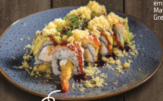
SUPER CRUNCH ROLL 16.25

Crabmeat, Cilantro, Onion Inside & Spicy Tuna, Albacore, Jalapeno On Top. Served with Spicy Ponzu