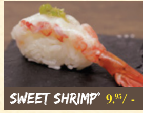
SWEET SHRIMP* 9.95/-