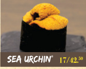
SEA URCHIN* 17/42.50