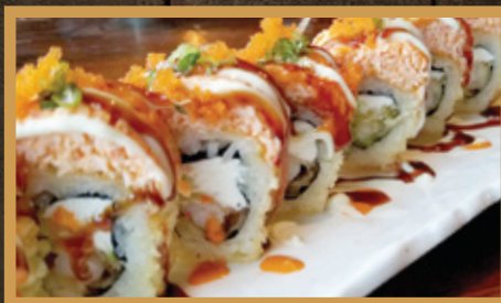
GOLDEN TIGER ROLL 16.50

Spicy Tuna, Cucumber Inside & Served Cajun Tuna on Top