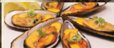
BAKED GREEN MUSSEL 10. 95 6pcs/ Baked Green Mussel with Cheese, Mayo Sauce. Served with Sauce, Green Onion and Masago