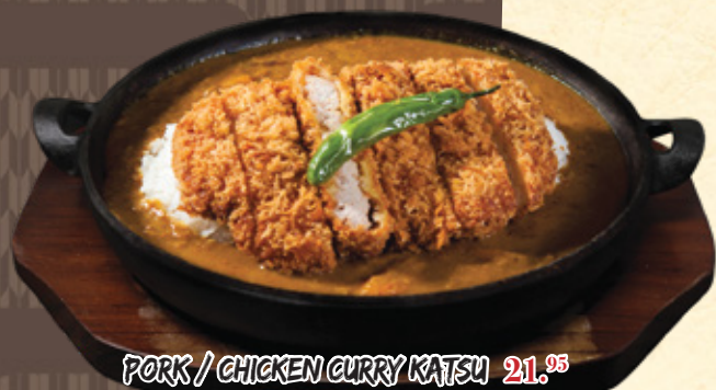
PORK / CHICKEN CURRY KATSU 21. 95

Grilled BBQ Short Rib, Grilled Shrimp Fried Veggie, Fried Rice