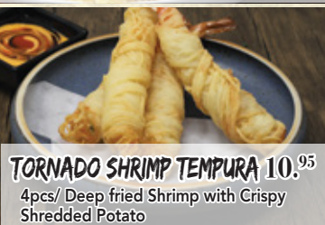
TORNADO SHRIMP TEMPURA 10. 95 4pcs/ Deep fried Shrimp with Crispy Shredded Potato